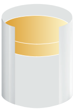
15% - 25% SIVACHROM EFFECT TINT BASE