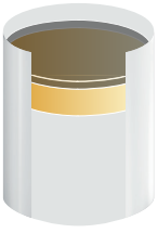
MAX 5% CLEAR PASTE TINT BASE + SIVACHROM EFFECT